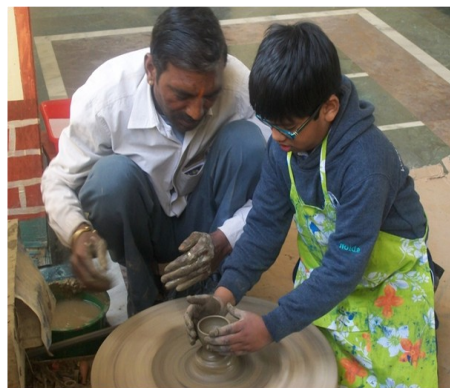
Working with a potter