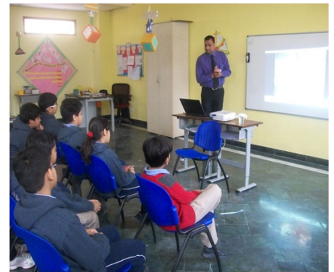
Interaction with a Space Scientist