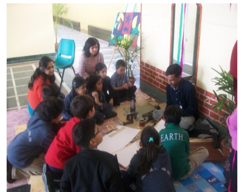
Working with a Cobbler