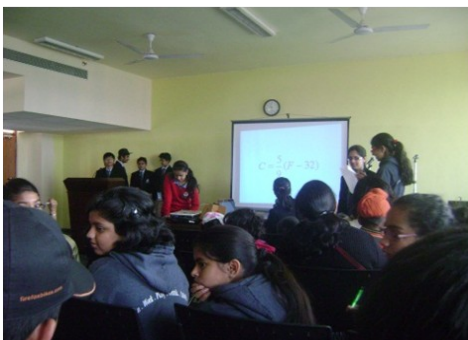
Assembly by Grade 8

Form 8 students had the responsibility of conducting assembly this Tuesday. As I went to them during lunch time on Monday, my natural question to them was, "Are you all prepared for your assembly? Do you think I should see a run through once? All of them replied in unison "Trust us, It's a surprise for you. We are doing something different" Another surprise! ,Doing something different !.....I was not sure , but I decided to trust them. And stu-