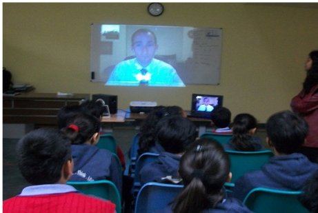
Skype Lesson Form 6

In our endeavor to expose our children to different educational envi-