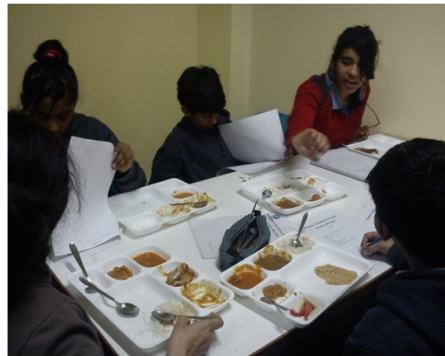
Student counsel members meeting with Cultural Secretary