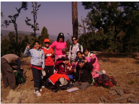
Celebrating the Treasure

He then said something really surprising! That there IS a treasure! He told us to look for it! We all spreaded around the place hunting for it vigorously. In fractions of seconds we found it! There were 11 chocolates!