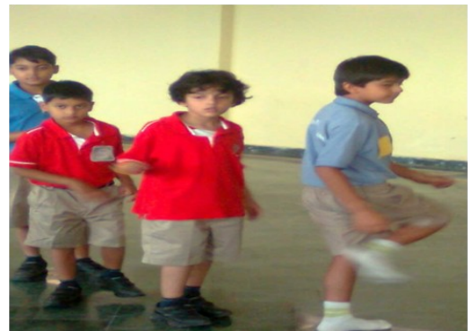
Walking in a line