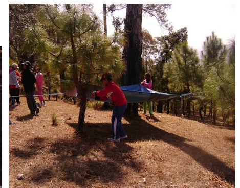
Children building survival shelter

We all had to build a survival shelter if it rains so we tried courageously. After half an hour Tara sir taught us the right way.